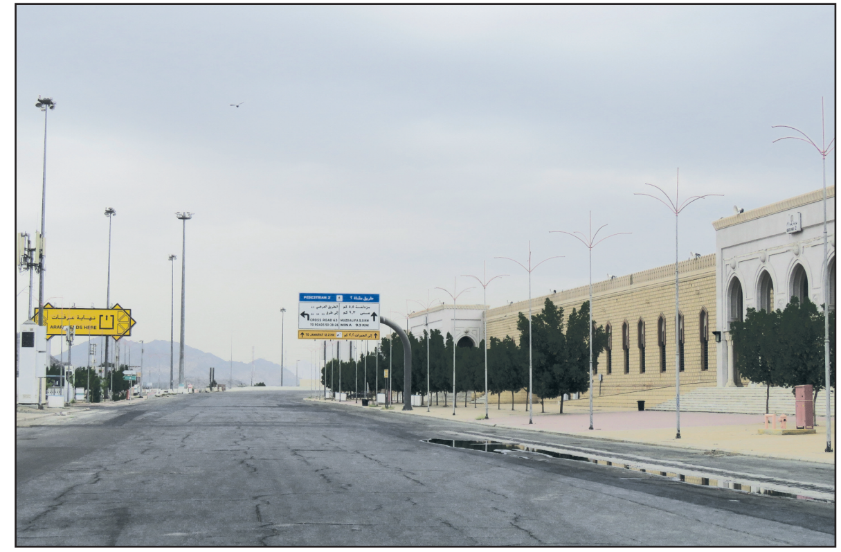
The yellow sign on the left of the photograph, opposite Masjidul Nimrah (on the right), bears the words, 'Arafat ends here.' However, the masjid extends beyond the boundary of Arafah, which means that pilgrims who stay on that side of the masjid from the time of Wuqoof till Maghrib will invalidate their Hajj.

When the mosque was extended afterwards, it then became divided into two sections. The front section, which was the location of the original Masjid Ibrahim, was outside Arafah with the back section being within the boundaries.