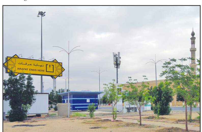
There are signs all around the boundary of Arafah, alerting the hujaai to the boundary to ensure that they are on Arafah from the time of Wuqoof to Maghrib. Since only a part of Masjidul Nimrah is on Arafah, there are also signs in the masiid to ensure that the hujaai in the mosque are in the right part of the mosque during that sacred period.

It is worth remembering that the Farewell Khutbah of our beloved Prophet (SAW) was delivered at Masjid Nimrah and that soon thereafter, the following revelation was sent down by our Creator: 'Today I have perfected your religion for you and completed My favour upon you, and Î have chosen Islam as your religion.' (Quran 5:3)